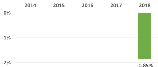
APS Diversified Bond Fund - Class C EUR Accumulator Shares

Past performance is not a reliable indicator of future results.